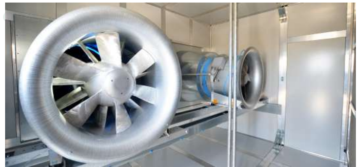
NOVENCO ZerAx® axial fans in parallel operation

For this strategic interest, the new device technology with ZerAx® fans fits perfectly.